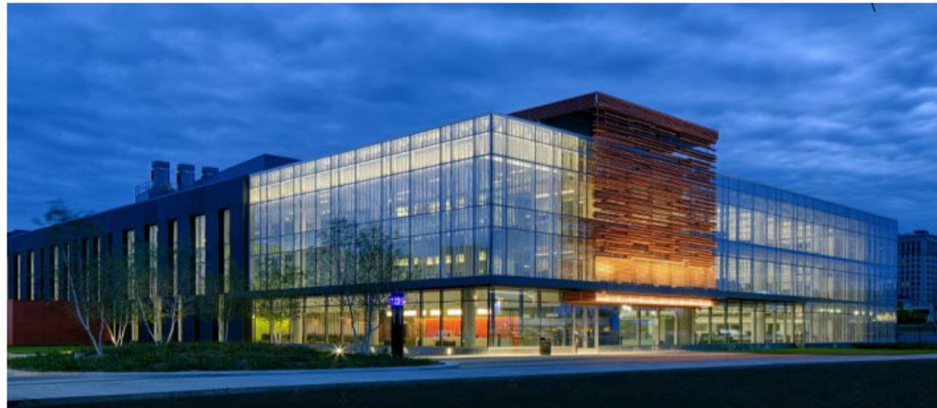
The Integrative Biosciences Center

Increase strategic integrative research and nurture the broad ecosystem for scholarly inquiry, discovery, creativity, and knowledge application by leveraging our academic strengths, community engagement mission, and urban location